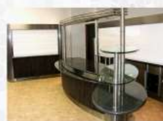
Table top display

(Includes registration for 1 person and gala evening dinner)